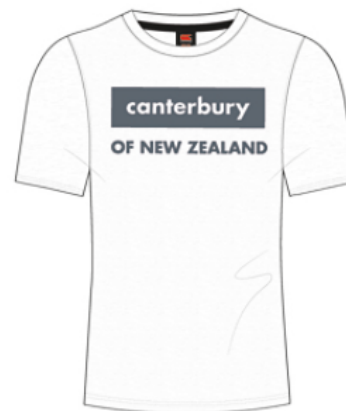
QA006503AM4 Future Utility White Marl H222