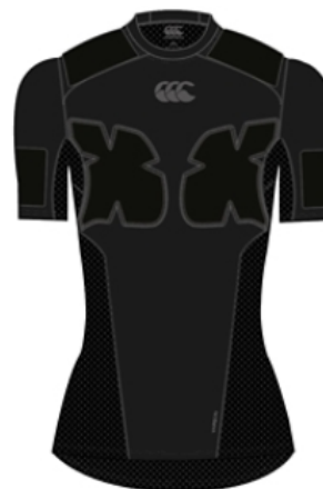
QA007130989 Black H222