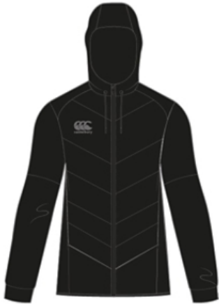
QA007199AN2 Black/Gunmetal Grey H222