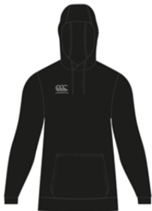
QA006493AN2 Black/Gunmetal Grey H222