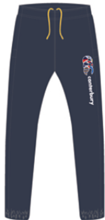
QA006843A88 Mood Indigo