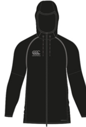
QA007200AN2 Black/Gunmetal Grey H222