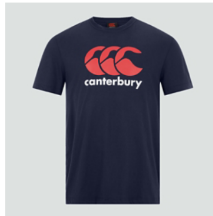
QA004799769 Navy H220