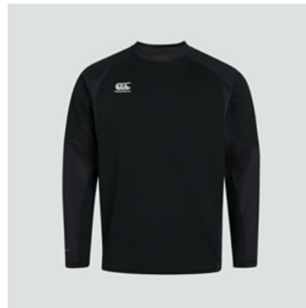
QA004077989 Black H219