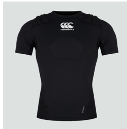
QA006436AH7 Black/White/Silver H221