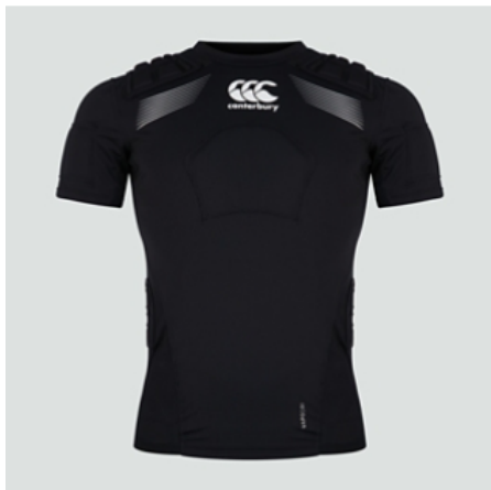
QA006437AH7 Black/White/Silver H221