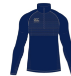
QA007203769 Navy H222