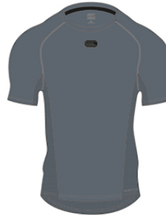
QA006483AL4 Stormy Weather H222