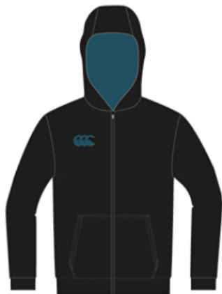
QA006501AM8 Black/Blue Coral H222