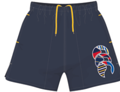
QA006877A88 Mood Indigo