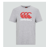
QA004799922 Classicmarl H220