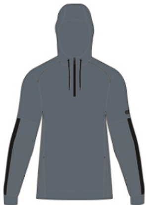
QA007205AL4 Stormy Weather H222