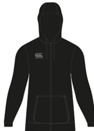
QA006494AN2 Black/Gunmetal Grey H222