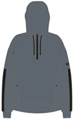
QA007148AL4 Stormy Weather H222