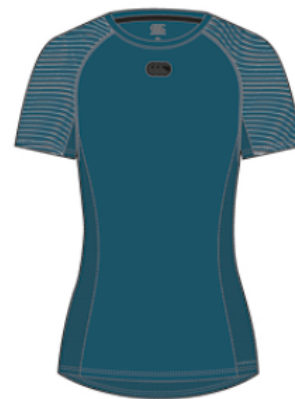
QA006465AF3 Blue Coral H222