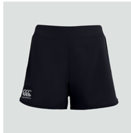
QA004794989 Black H220