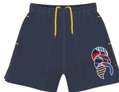
QA006935A88 Mood Indigo