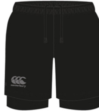
QA007450AN2 Black/Gunmetal Grey H222