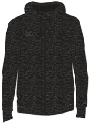
QA005610AL5 Future Utility Marl H222