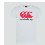
QA004799A81 Brightwhite H220