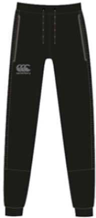
QA007201AN2 Black/Gunmetal Grey H222