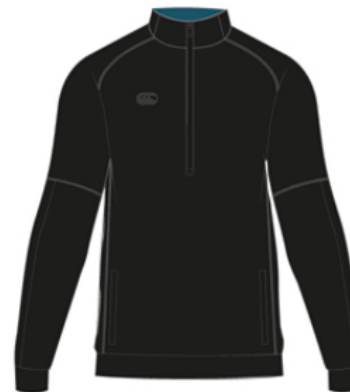
QA007206989 Black H222