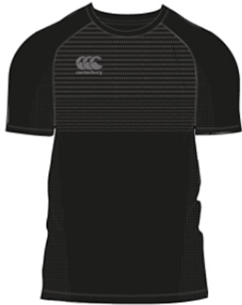
QA007214AN2 Black/Gunmetal Grey H222