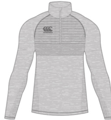
QA007203922 Classicmarl H222