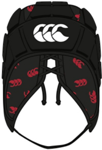
QB000039A49 Black/True Red H222