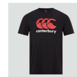
QA004799989 Black H220