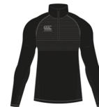
QA007203AN2 Black/Gunmetal Grey H222