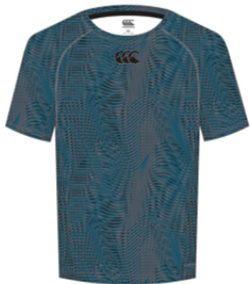
QA006507AF3 Blue Coral H222