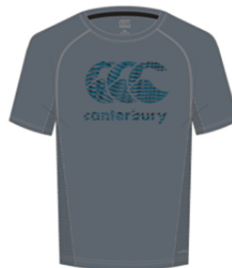
QA006508AL4 Stormy Weather H222