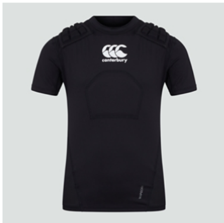
QA006438AH7 Black/White/Silver H221