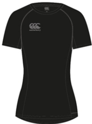
QA006464AN2 Black/Gunmetal Grey H222